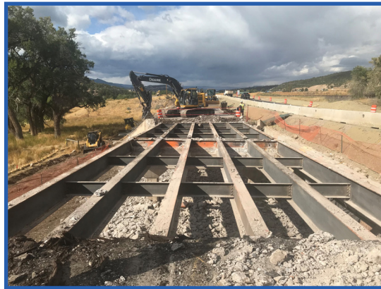
Removal of girders at Castle Creek Bridge.