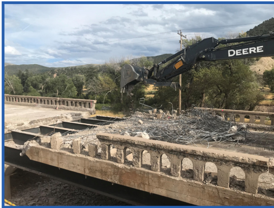
Demolition of the bridge over Castle Creek.